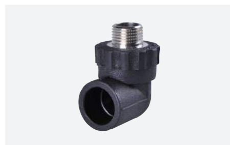
MALE THREADED ELBOW