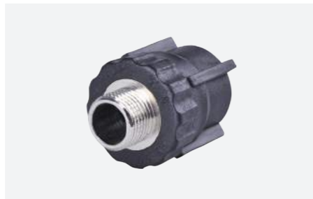
MALE THREADED COUPLING