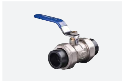
HOT FUSION BRASS BALL VALVE