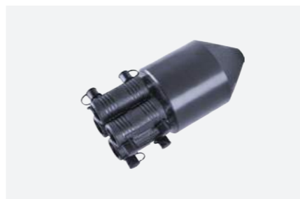
DOUBLE U HEAD