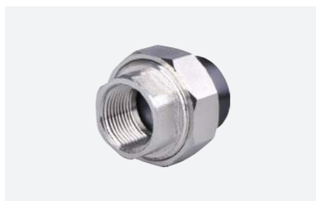
FEMALE THREADED UNION