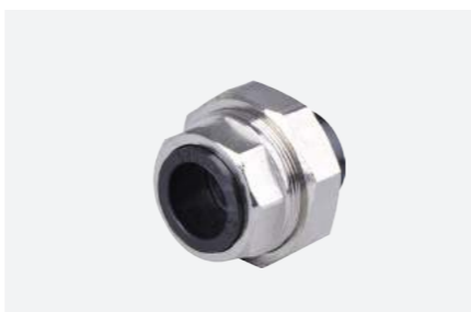
DOUBLE PLASTIC UNION