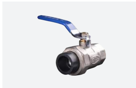
SINGLE FEMALE BRASS BALL VALVE