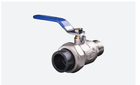
SINGLE MALE BRASS BALL VALVE