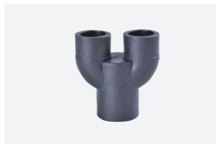
Y TYPE TEE