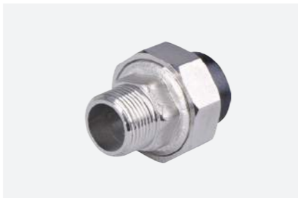
MALE THREADED UNION