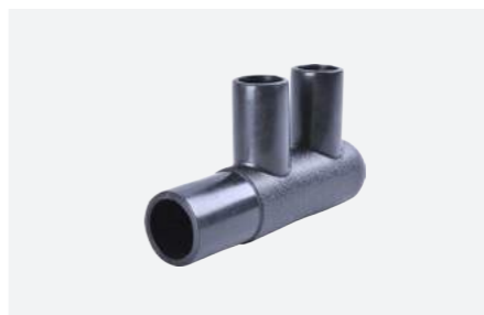
F TYPE TEE