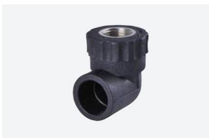
FEMALE THREADED ELBOW