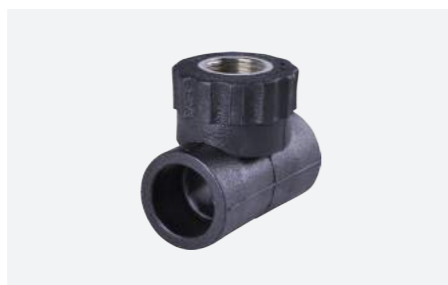
FEMALE THREADED TEE