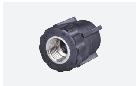
FEMALE THREADED COUPLING