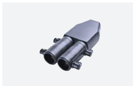
SINGLE U HEAD