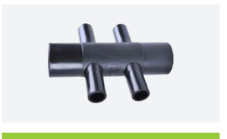
SIX-WAY REDUCING TEE