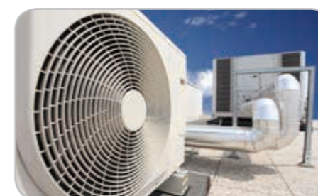
Air conditioning system