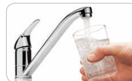
Portable water system